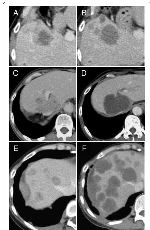
Fig. 1 Patients presenting optimal morphologic responses during treatment with regorafenib. A, B. Optimal morphologic response observed at 175 days after initiation of regorafenib. Size of tumor was slightly increased (+6.0%) with reduction in CT density. CEA levels were 911 ng/ml (A) and 840 ng/ml (B), respectively. C, D. Optimal morphologic response observed at 105 days after initiation of regorafenib. Size of tumor was slightly increased (+16.0%) with evident change in CT texture of tumor. CEA levels were 860 ng/ml (C) and 910 ng/ml (D), respectively. E, F. Optimal morphologic response observed at 90 days after initiation of regorafenib. Although there was remarkable progression of tumor in number and size, serum CEA levels decreased from 91.7 ng/ml (E) to 66.1 ng/ml (F)

Serum tumor markers, such as carcinoembryonic antigen (CEA), were analyzed in all the patients at the time of radiographic evaluation during regorafenib treatment. The median rate of CEA increase was 2.02 (range, 0.75–