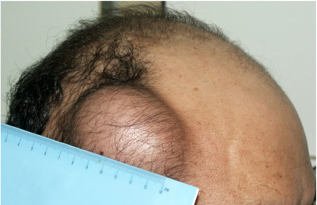
Figure 1 Photograph of the patient showing the described 7 cm mass at the site of the trauma at the right lateral side of his head.

soft tissue component and meningeal invasion. T2 weighted image demonstrated the above described findings with meningeal thickening. There was no evidence of metastatic brain disease. Bone window of a non-enhanced CT of brain for radiation therapy planning purposes, showed a large lytic lesion with a soft tissue component of the right parietal bone. Chest X-ray showed no change in the residual ill defined left upper lobe density that the patient had in 2002. We concluded that the patient had an isolated tumor recurrence in his skull and proceeded with radiation therapy. The lesion showed decrease in size by the end of radiation. Fifteen days later, the family reported that the patient died at home of massive hemoptysis.