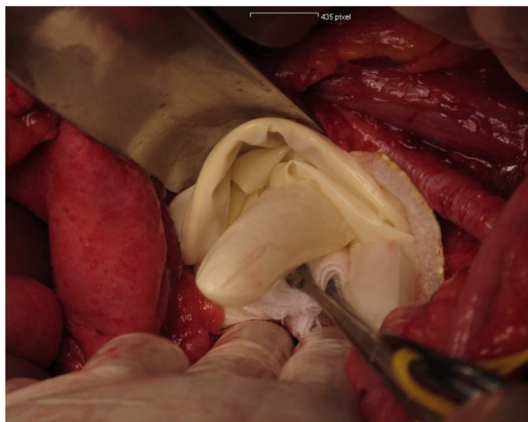
Figure 2 Tachosil® is applied with a wet glove and sponge and compression for 30–60 seconds. Thereafter glove and sponge are removed.

A power calculation demonstrated that, with a sample size of 70 per group, a two-arm study has a power of 80% to detect a 66% absolute difference in treatment