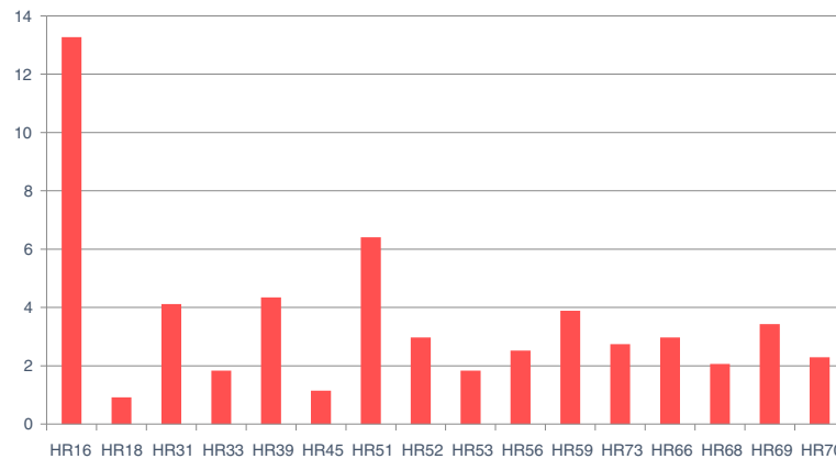
Fig. 1 Percentage of high risk (HR) viral serotypes. Percentage of high risk (HR) viral serotypes with respect to total sample size

authors [38] have also used the same cancer-affected breast as control. However, in our opinion the use of these controls is questionable from a methodological perspective, since the breasts involved presented cancer and were, therefore, not normal. Most of the published studies do not follow a precise methodology, and the screening criteria used are very heterogeneous. Some studies only consider juvenile malignancies [34], while others include inflammatory breast cancer tissues [48, 49], triple-negative tumors [50], medullary malignancies [51], metaplastic breast cancer [52], papillary lesions [20, 53], Paget’s disease [54], or carcinoma in situ [9, 24, 25, 36, 41, 55–60]. In addition, no standards are used in selecting the molecular technique to screen for viruses, implying the potential detection of different viral serotypes. Therefore, it is quite likely that, discrepancies among the studies are due to the factors mentioned above.