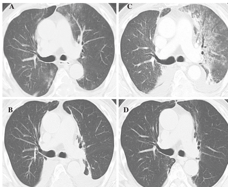
Figure 2 Radiation recall pneumonitis induced by sunitinib. On the 14th day of sunitinib induction, bilateral lung consolidation appeared (A). During follow-up without sunitinib, consolidation developed along with progressive fever (B). After steroid pulse therapy, the CT findings revealed that the interstitial filtration was localized in the previously irradiated area (C). No evidence of relapse of recall pneumonitis during sorafenib treatment was observed (D).

therapy, the symptoms gradually improved over 7 days. The radiological findings revealed that the interstitial filtration was localized within the previously irradiated area (Figure 2C). Therefore, the patient was diagnosed with radiation recall pneumonitis that was induced by sunitinib. During the treatment, serial sputum specimen and blood culture examinations did not reveal any significant bacteria or fungus. The patient recovered from the interstitial lung disease completely during the