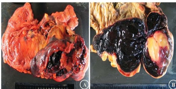
Figure 2 Macroscopic findings of the colon mass. A huge lobulated soft mass, measuring 20 × 13 × 10 cm, is noted at the ascending colon(A). Cut surface is mostly hemorrhagic gelatinous with small portion of yellowish gray solid nodule(B).

Macroscopic examination of the ascending colon revealed a large, lobulated, dumbbell-shaped soft mass that measured 20 × 13 × 10 cm, along the mesenteric border (Figure 2A). A portion of tumor was exposed and underlying hematoma was observed. Upon opening the intestine, the mucosa was discolored but intact. Upon sectioning, the cut surface was soft, friable, dark-red, and gelatinous, with a focal, yellowish-gray, solid portion, and hemorrhage (Figure 2B). Microscopic examination demonstrated loose proliferation of stellate or spindle cells on myxoid stroma, with occasional mature lipocyte-like cells (Figure 3A). They were supported by thin arborizing vasculature (Figure 3B). Rare multivacuolated lipoblasts were found (Figure 3C). Tumor cells extended upward to the submucosa, accompanied by extensive submucosal hemorrhage, but the overlying mucosa was intact (Figure 3D). The retroperitoneal masses were multiple, isolated, or conglomerated, golden to pale-yellow, glistening solid nodules, which measured 12 cm in their largest diameter. Their microscopic findings were compatible with well